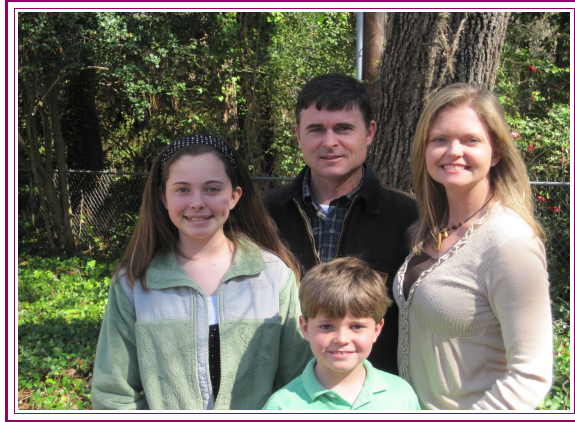
Haskell Family, SC